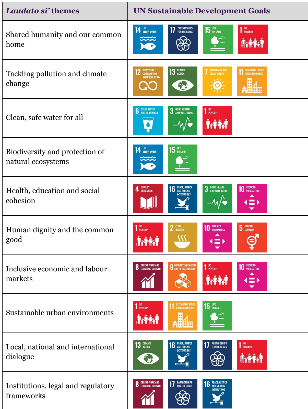
Figure 1. Laudato si' and the UN SDGs 6